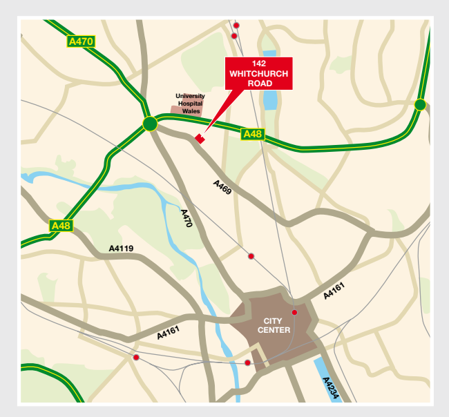
Plans for identification purposes only. Not to Scale.